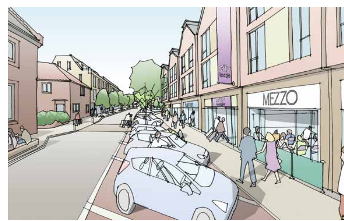
Artist's impression of St Andrews Street North adjacent to the library

Redevelopment has significant potential to establish a higher quality and standard of development, particularly along St Andrews Street and Tayfen Road. The proposals must protect the amenity of local residents through careful design.