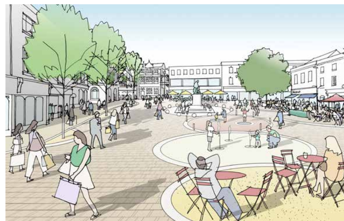
Artist's impression of Cornhill showing pedestrianised square

Unify the paving and appearance of the whole area to enhance the character and appearance linking the arc to the historic location in the town centre. Remove barriers to access by creating a clear, safe and direct pedestrian route from the arc, across St Andrews Street South, through to Cornhill to Buttermarket.