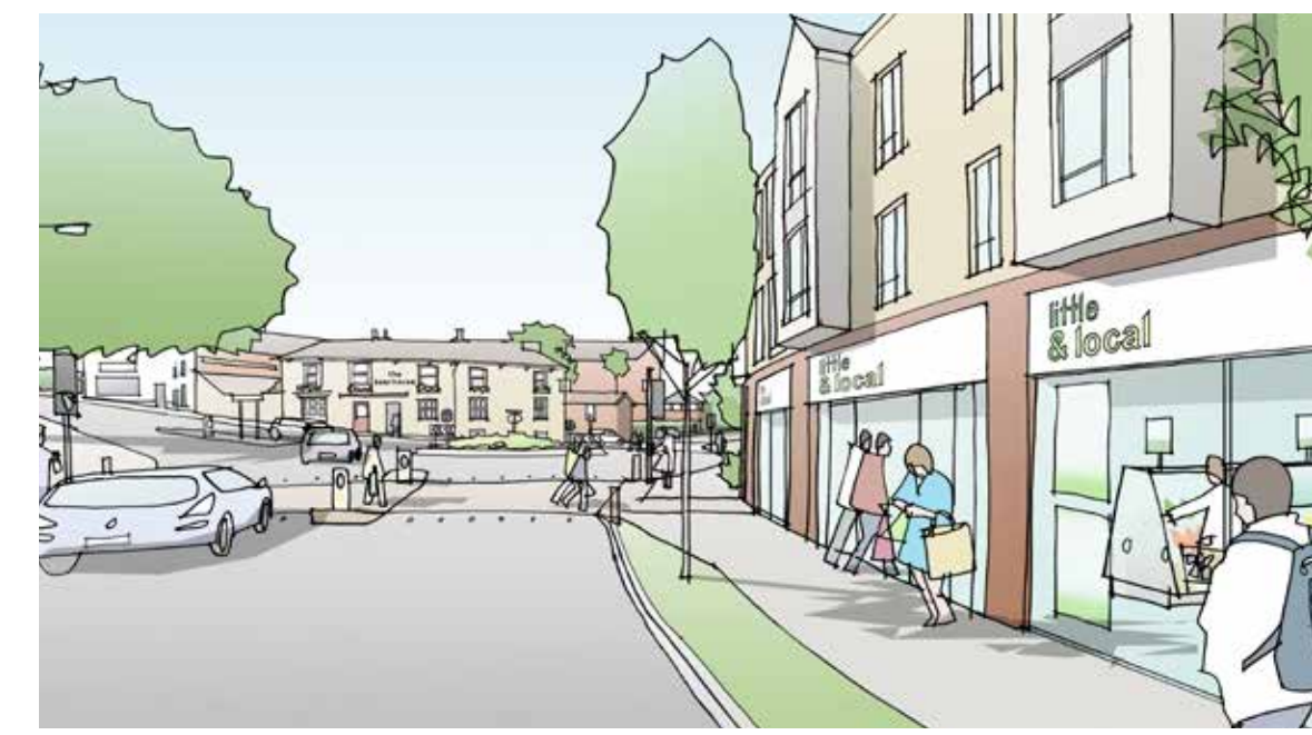
Artist's impression of a new pedestrian crossing from the railway station and development adjoining Tayfen Road

Through enhancements improve the image and character of this part of the town centre, making it a more attractive and welcoming gateway for Bury St Edmunds.