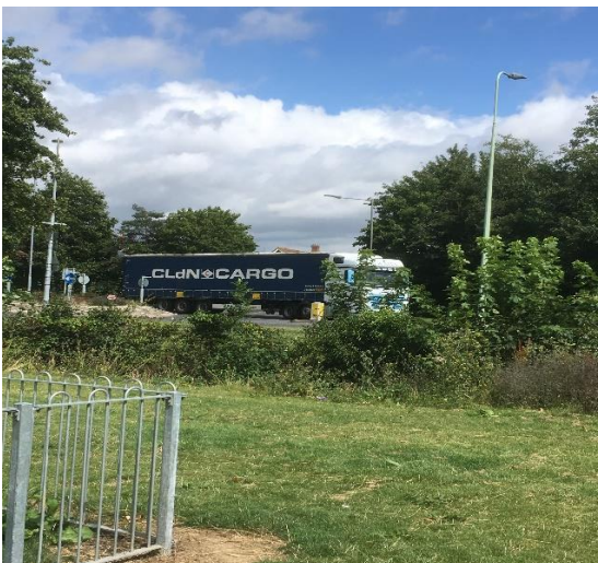
CLDN Cargo – March 2021 (Freight)