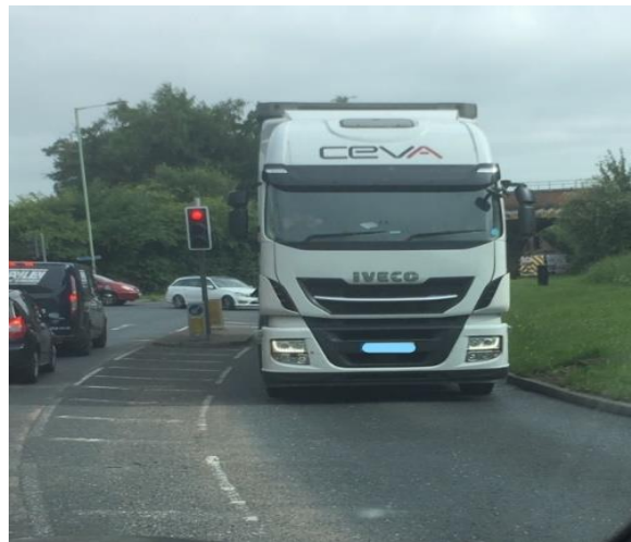
CEVA – March 2019