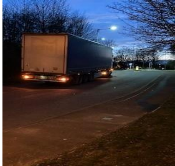
Parked Cransbill Drive - 25 March 2021