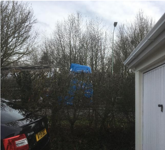
Hewicks Haulage Parked outside my house in Bluebell Avenue