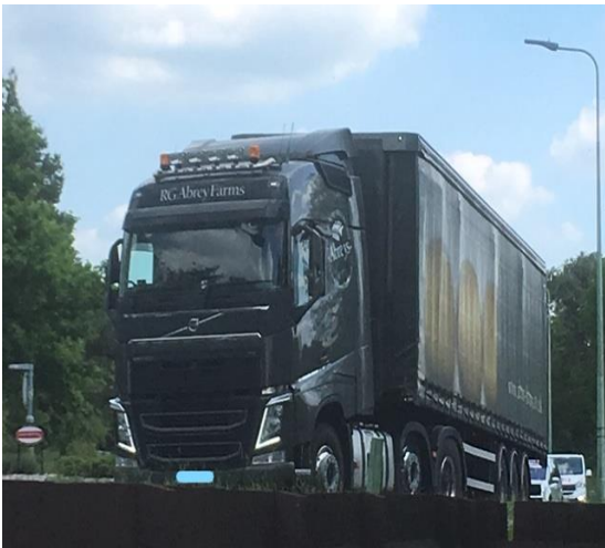
Abrey Farm – October 2019