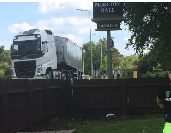
Unmarked Tipper – October 2019