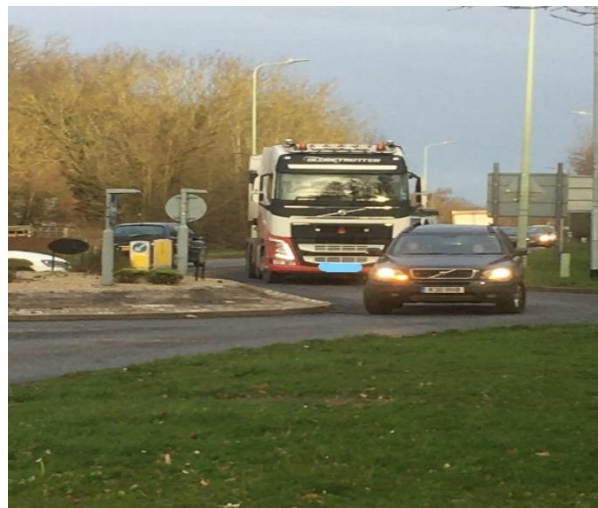
Globetrotter – March 2021