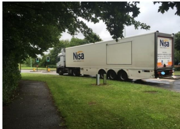
NISA – 44ft October 2019