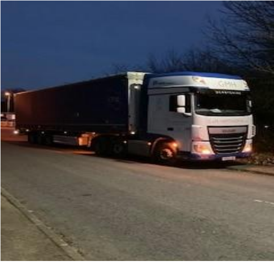
Parked Cransbill Drive – 25 March 2021 Reported on Highways website.