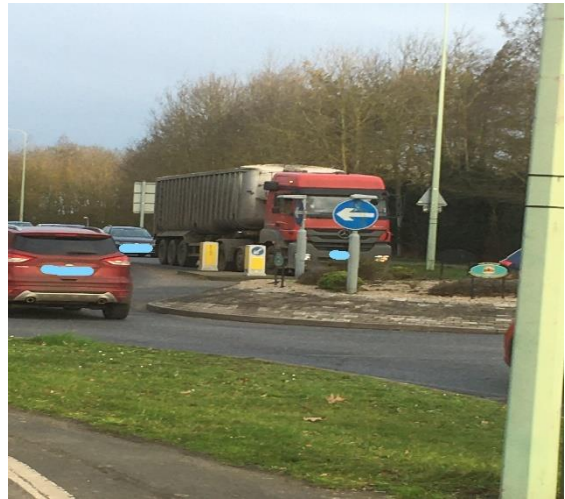
Unmarked Tipper – March 2021