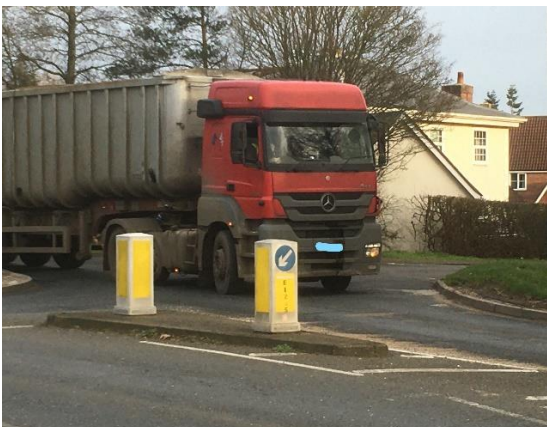
My house -Bluebell Avenue Unmarked Tipper – March 2021