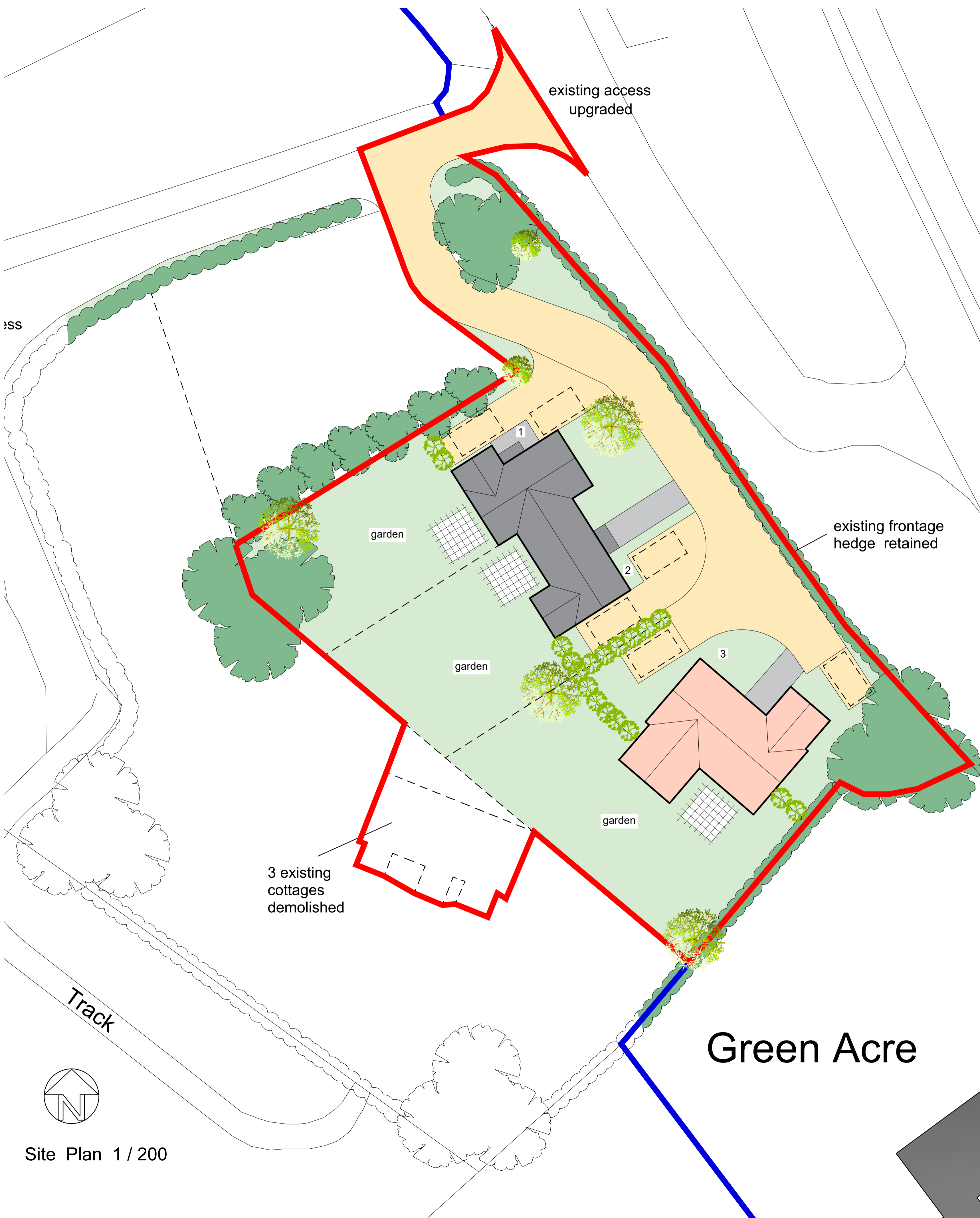
Site Plan 1 / 200