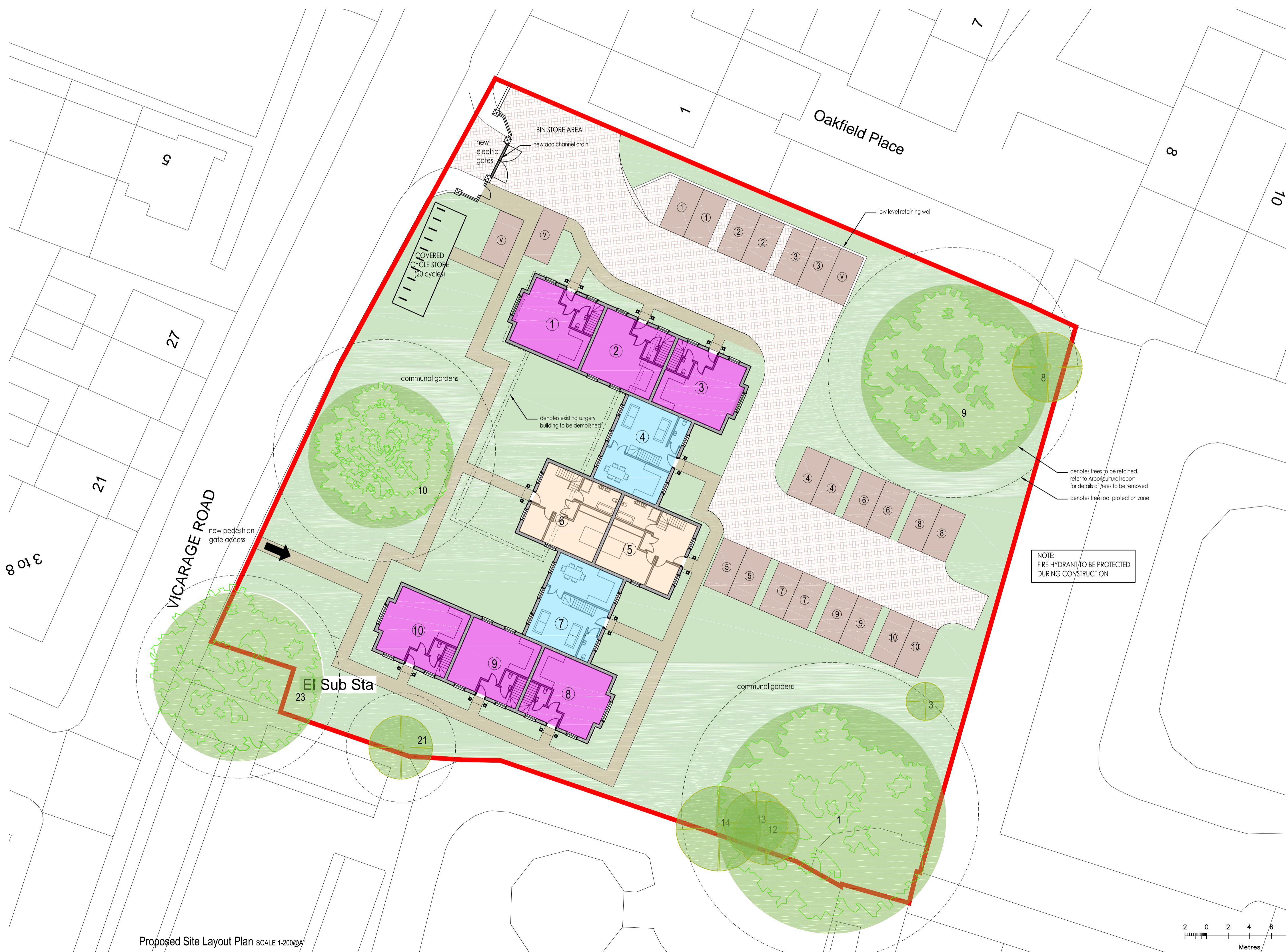
Proposed Site Layout Plan SCALE 1:200@A1